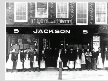
Former offices of the Leighton Buzzard Observer (location 12).