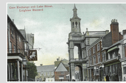
Corn Exchange on Lake Street (location 3).