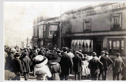
The Top Bell Hotel on fire (location 6).