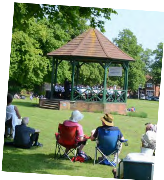
Fun in the Park