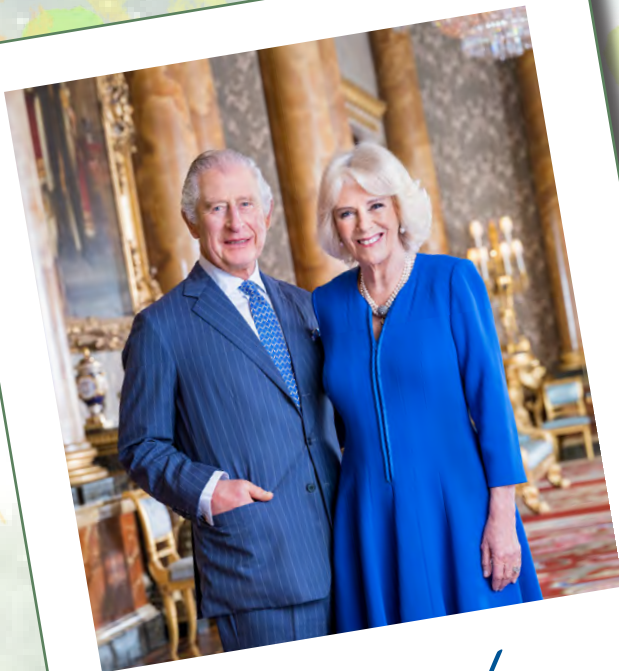
Coronation of King Charles III