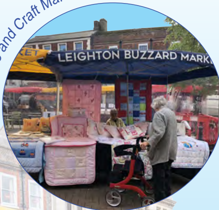
Handmade and Craft Market

food shop at our Farmers and Producers Market, buy gifts at our Handmade and Craft Market make the most of all our stallholders expertise. #LoveYourLocalMarket.