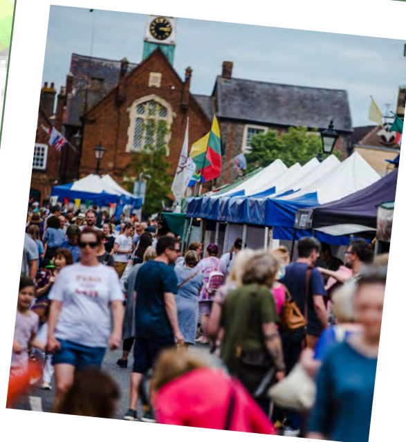
Big Lunch Food Festival