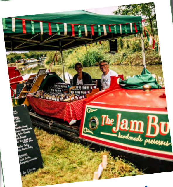
Linslade Canal Festival

Our park is also home to the splash and play, beach, BMX pump tracks and our new adventure playground which all can be enjoyed for free.